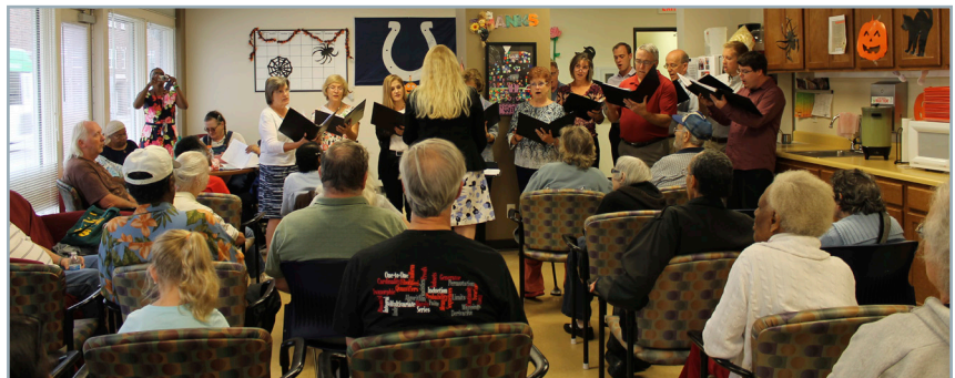
The Symphonic Choir Chamber Singers performing at the John. H. Boner Community Center in October 2015.

In partnership with area senior communities, Timeless In Song enhances the quality of life for members of the city's senior population through access to free or reduced concert tickets, transportation assistance, and on-site (mobile) performances. Established in 2011, Timeless In Song annually reaches 1,100 low-income seniors – and the need continues to grow as Baby Boomers begin to cross into the senior years. Your support of the Symphonic Choir provides fulfilling artistic experiences for persons of all ages, including those older persons, many of whom never have stepped foot in a concert hall.