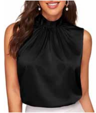
To wear under long sleeved black jacket.