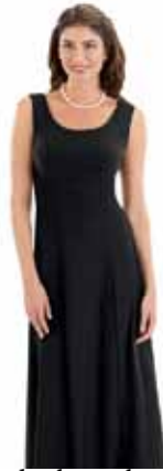
To wear under long sleeved black jacket. ISC Vendor. Hanna $61