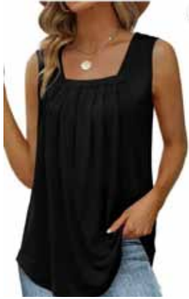
To wear under long sleeved black jacket.